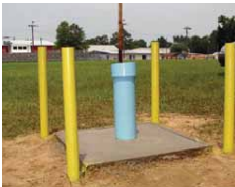
Wells in and around El Dorado, Ark., serve as monitoring sites to collect data on the recovery efforts to save the Sparta Aquifer.

required. The monitoring wells needed to be placed in certain locations throughout Union County — specifically around the Sparta's deepest cone of depression beneath El Dorado — and they needed to meet strict testing criteria to support the integrity of the results. Some existing wells met the criteria, and some needed to be constructed. That meant the team needed property owners' permission or right-of-way access onto personal and municipal property.