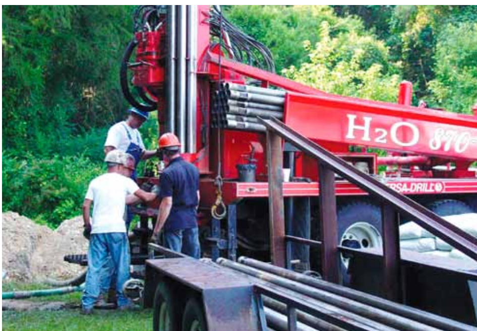
While some existing wells met the criteria as testing sites to monitor the recovering Sparta Aquifer, some new wells had to be dug in and around El Dorado, Ark.